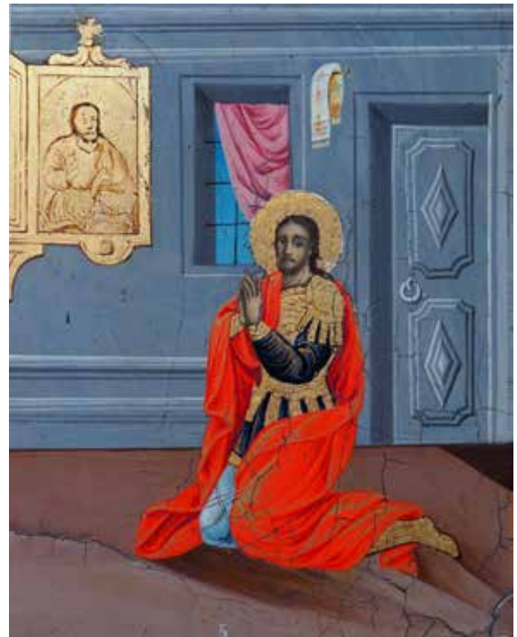
Fig. 3. St Nicholas is praying, icon 'St Nicholas the New Martyr of Sofia with scenes of his vita', 1882, detail