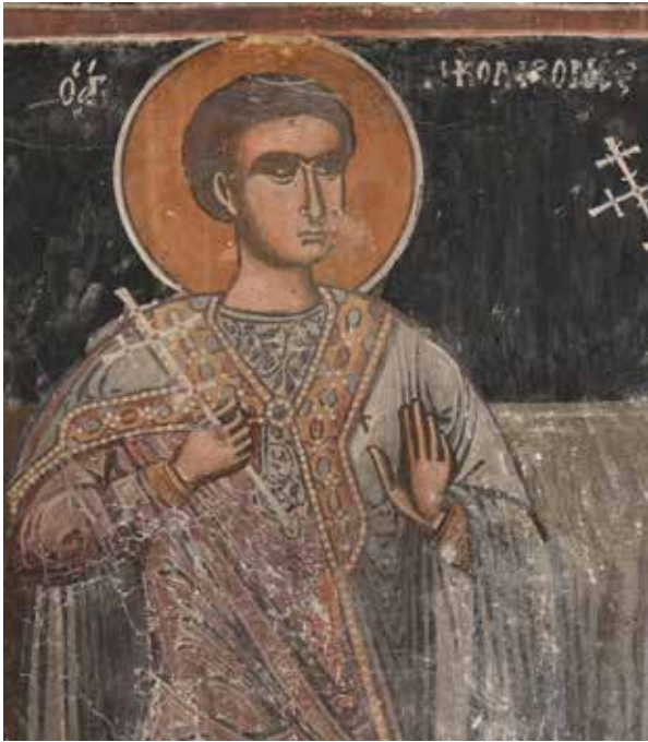
Fig. 5. St Nicholas the New Martyr in the church 'St George' in Veliko Tarnovo, 1616