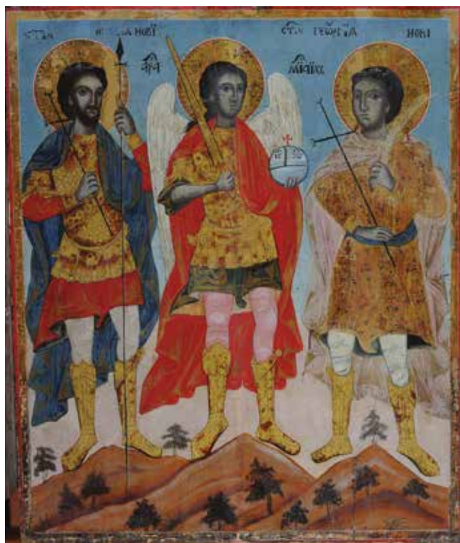
Fig. 4. Icon of St Nicholas the New Martyr of Sofia and St George the New Martyr of Sofia (NAIM № 924), Museum of Christian Art at the Crypt of St Alexander Nevsky Cathedral; end of 18 th – beginning of 19 th century

particle of the relics to the church of St Nicholas and it is still kept there. Presently, it is placed for veneration along with particles of St Charalampus' relics next to the ambo.