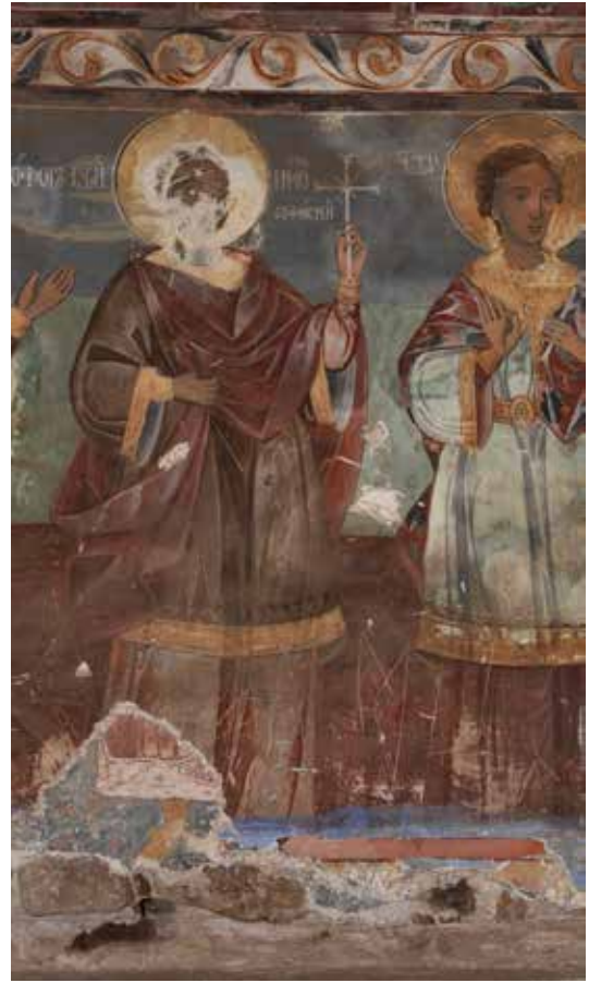
Fig. 6. St Nicholas the New Martyr of Sofia in the church of St Nicholas Seslavski Monastery (1616). The saint is presented on the north wall which has been redecorated in the 19 th century

is the most voluminous vita in Bulgarian hagiography 11 , commissioned by the Sofia clergy 12 and composed by Matej Gramatik, a man of letters from Sofia, a contemporary of the saint who knew the martyr personally. The original manuscript of Matej Gramatik has not reached us. The vita has survived in a single copy of 1564 13 . A note by the copyist on the last page of St Nicholas' vita makes it clear that the copyist was Priest Lazar from Kratovo 14 . It has been established that in 1563 Matej Gramatik asked Priest Lazar from Kratovo to copy the liturgy, the vita and the encomium on St Nicholas the New Mar-