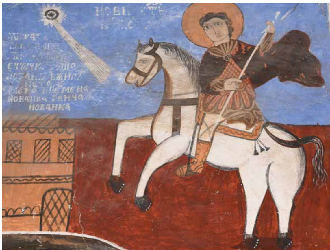
Fig. 7. St Nicholas the New in the church of St Paraskeve, Breze village, 1882