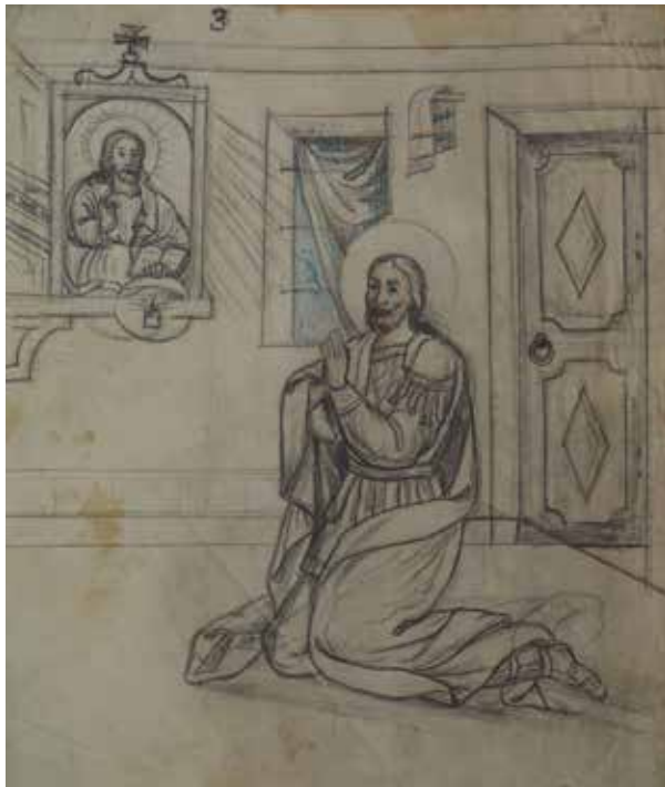
Fig. 2. Preparatory sketch by V. Popradoikov, Sketchbook, Inv. № 1124, Museum of History in Samokov