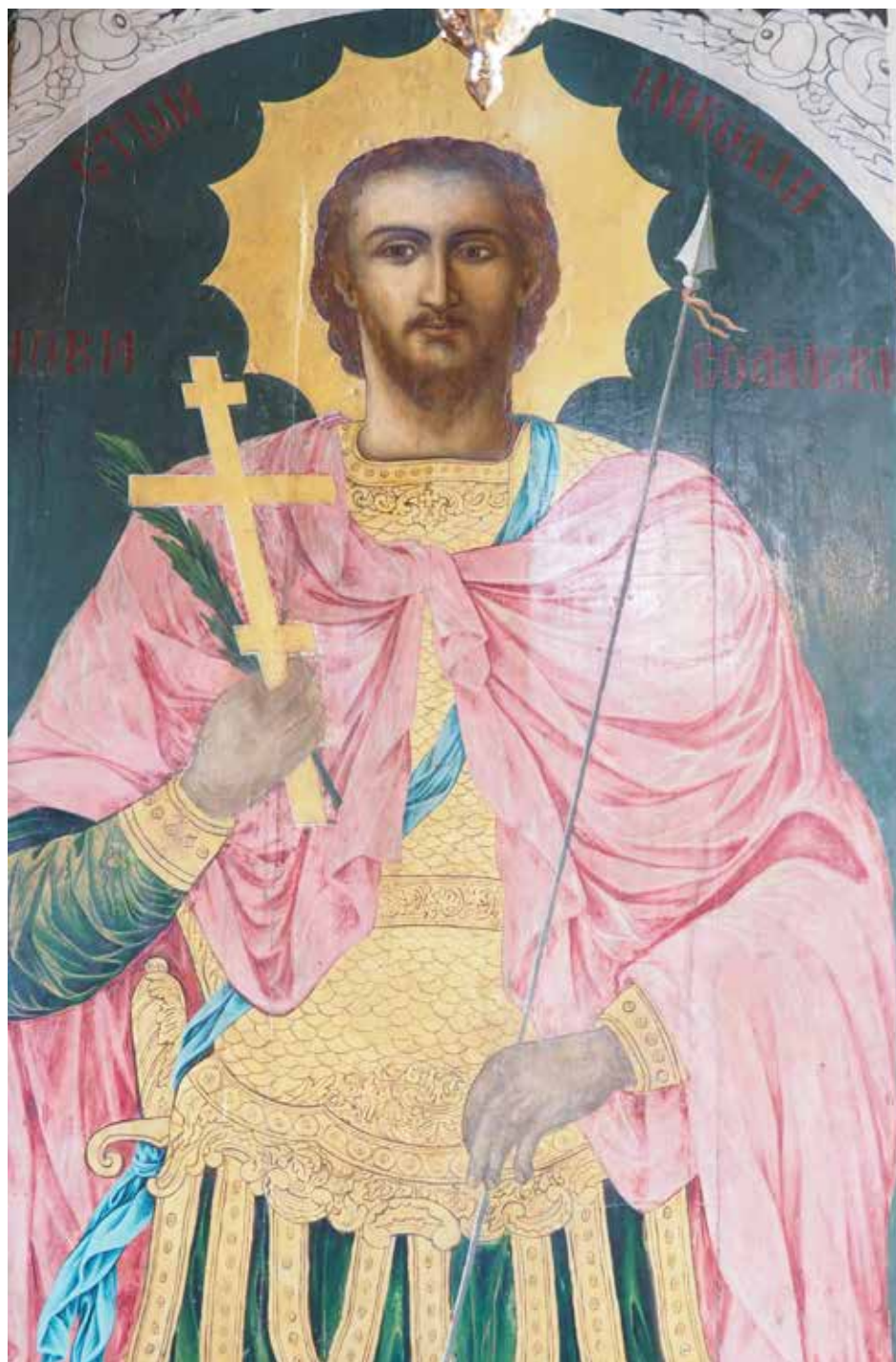
Fig. 8. Free standing icon from the church of St Nicholas the New Martyr of Sofia. Signed by Vasil Popradoikov, dated March 1891